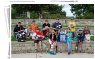
Kids Fishing Derby 2009