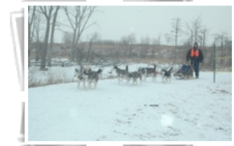
Musher Mania 2009